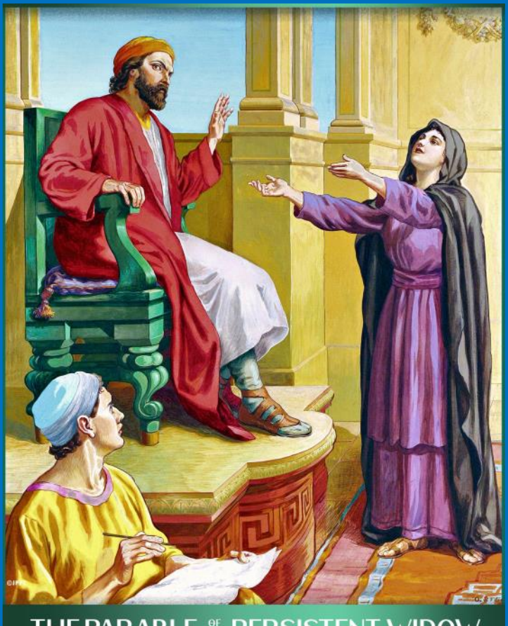
THE PARABLE OF PERSISTENT WIDOW

Church open for Private Prayer: Mon.-Fri. 10:00am - 8:00pm