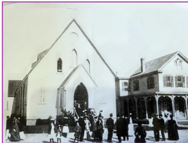
St. Mary's Church 1870s

In 1878, St. Mary’s Church would be moved across Washington Street to the present site of Our Lady Star of the Sea